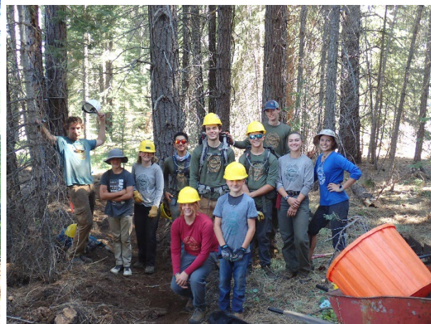
Photo: P Crew building the trail at Mountain Meadows Reservoir, by Mountain Meadows Conservancy, 2022